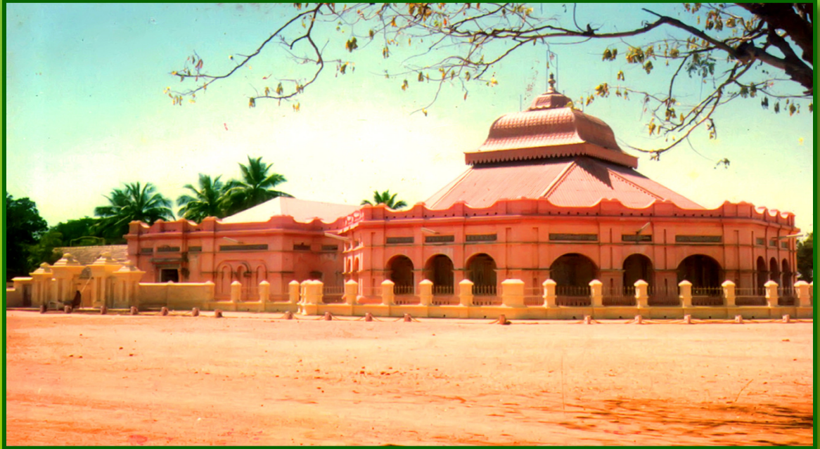
SATHIYA GNANA SABAI