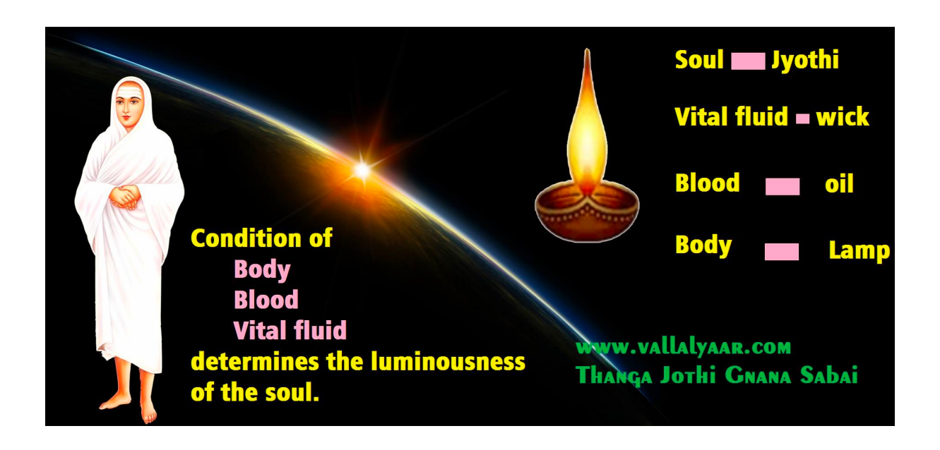
More detail www.vallalyaar.com